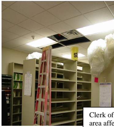
Clerk of Courts filing & office area affected by the water leaks.

Water in the Courthouse again! The Supervisors are extremely concerned with the re-occurring water, electrical and sewer issues!