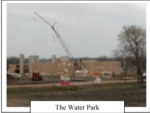
The Water Park