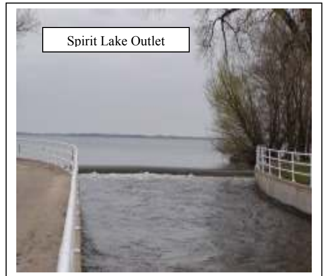
Spirit Lake Outlet