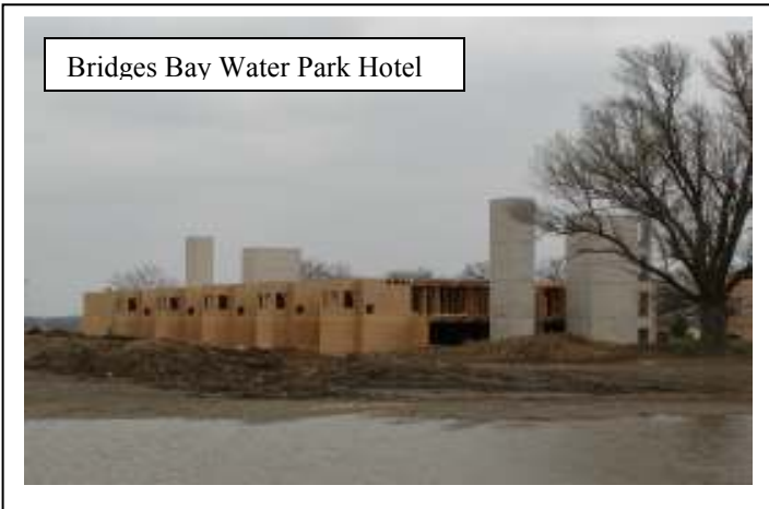
Bridges Bay Water Park Hotel